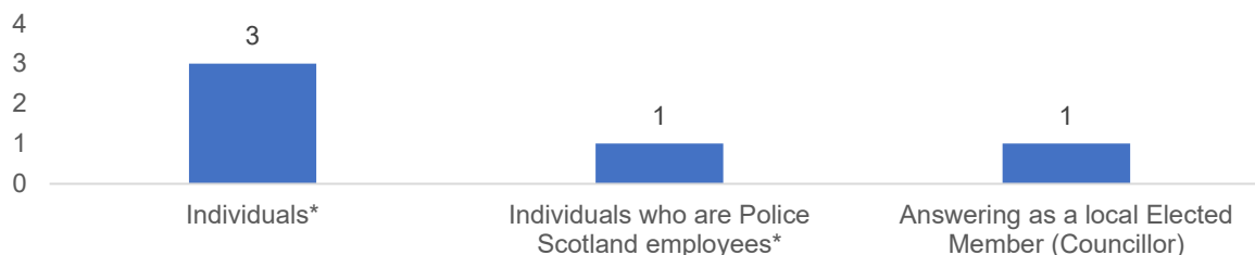
Breakdown of respondents - total respondents (n = 5) received by classification

Listed below are the 3 most prevalent themes at a total sample level. This is to provide an understanding of the issues reported across the total sample. Themes are not presented in an order of magnitude.