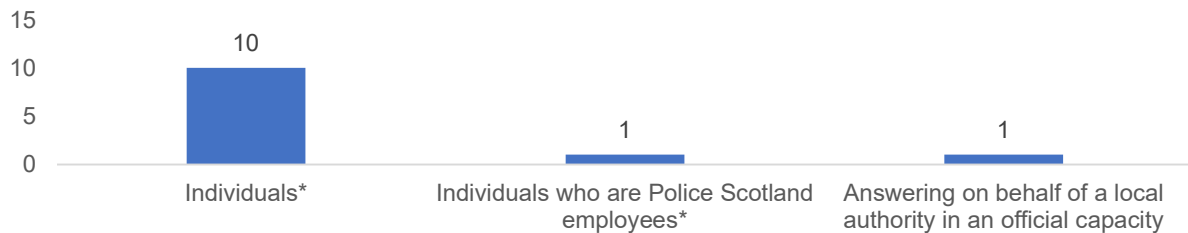
Breakdown of respondents - total respondents (n = 12) received by classification

Listed below are the 6 most prevalent themes at a total sample level. This is to provide an understanding of the issues reported across the total sample. Themes are not presented in an order of magnitude.